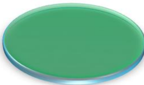
Fig. 2 Graphical representation of the spacetron (shown with tilt for ease of presentation of the spatial layers)

Let us assume that the basis of the space chosen as the substrate is discrete elements into which the entire 2-dimensional plane provided by them is divided. As such discrete elements we choose disks of different sizes, each of which, hereinafter referred to as a spacetron (Fig. 2).